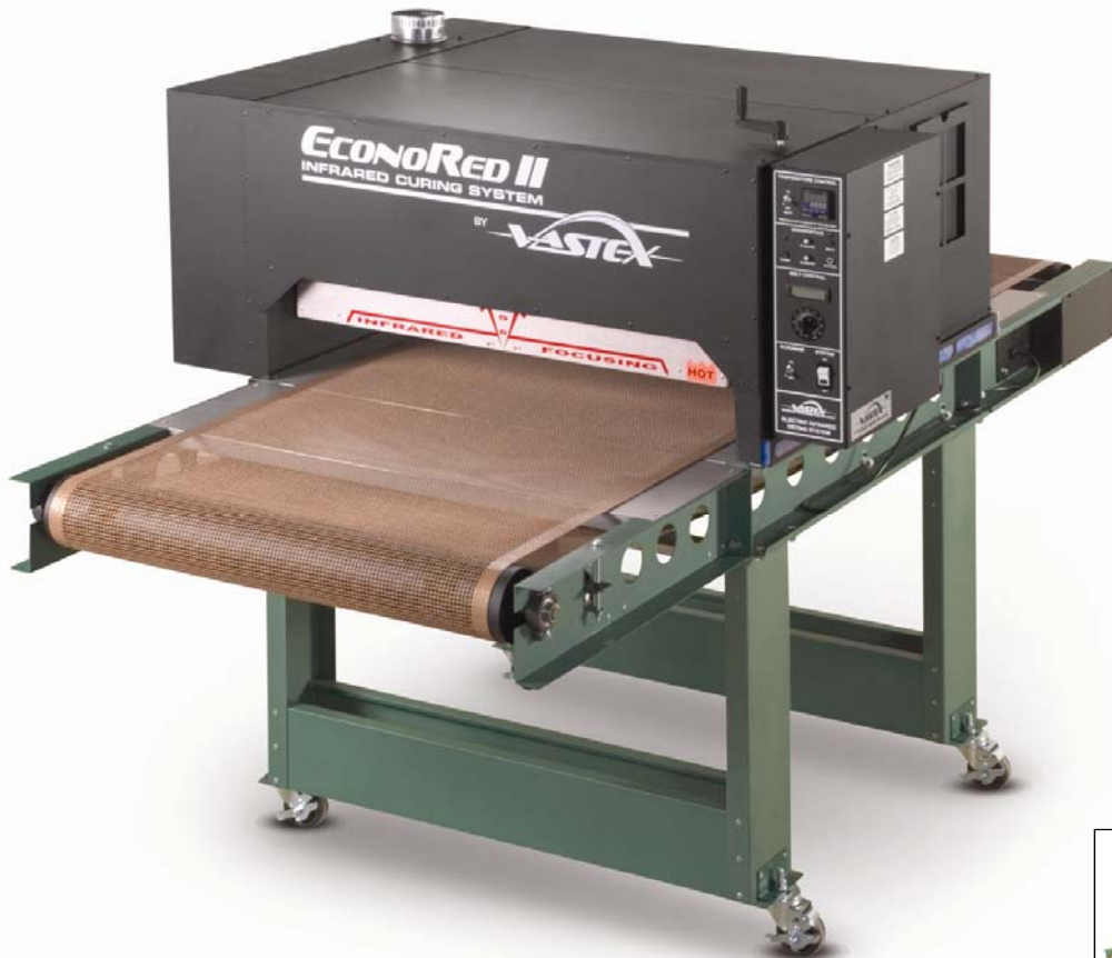
EC-II-30 shown with optional wheels