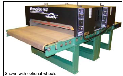
Shown with optional wheels